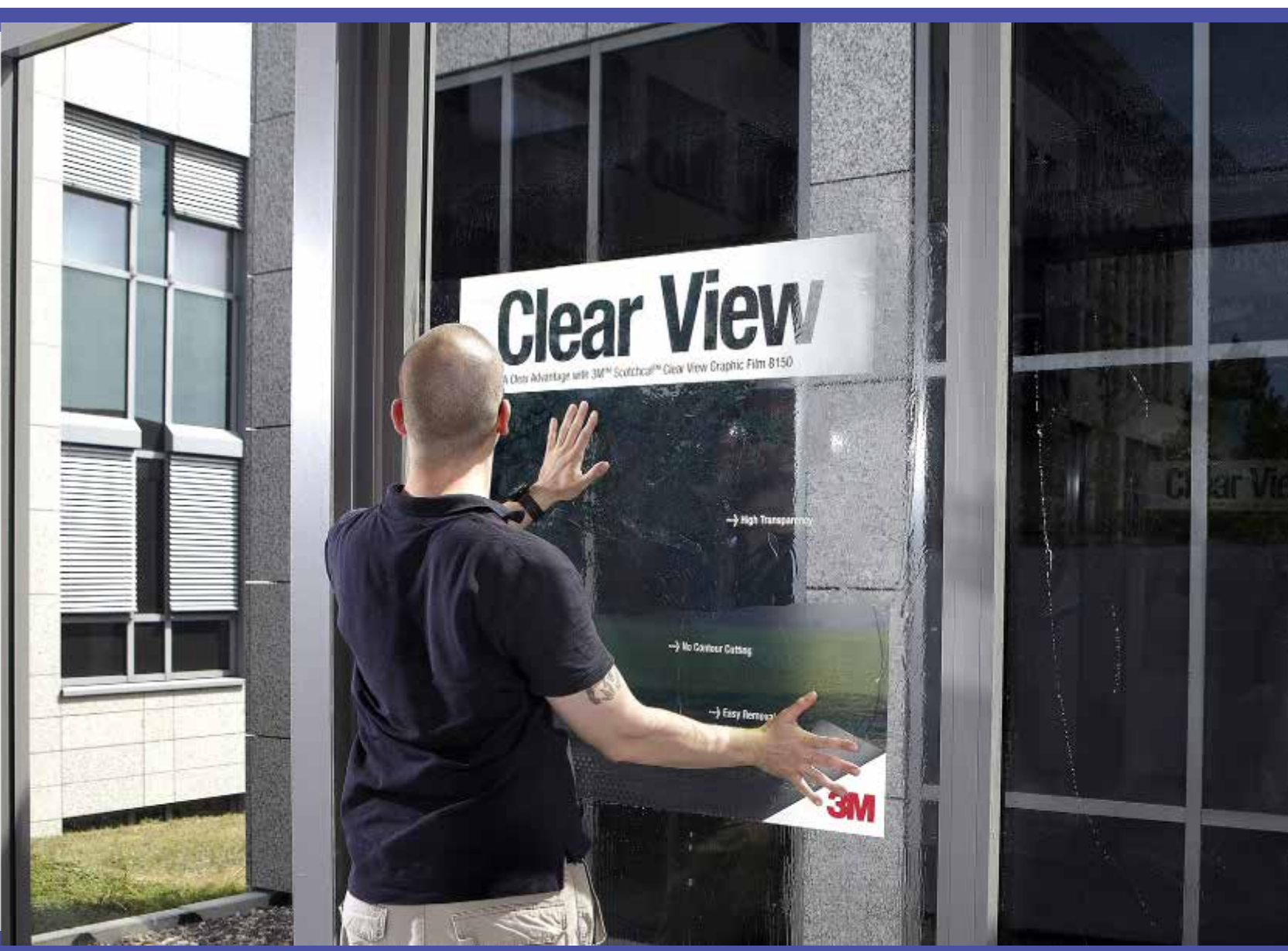
Making a perfect wet application of 3M<sup>™</sup> Scotchcal<sup>™</sup> Clear View Graphic Film 8150 | Step 12: