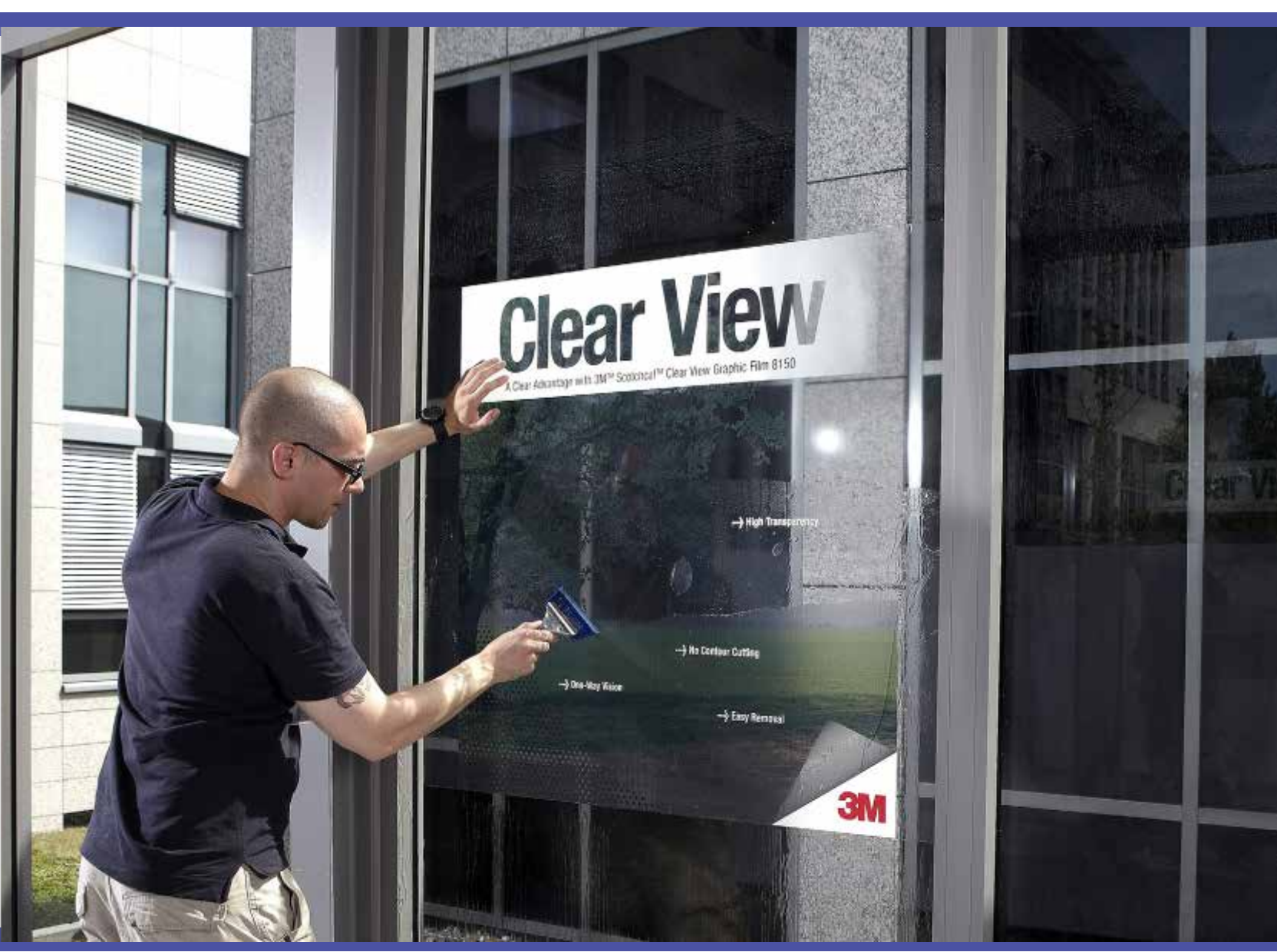
Making a perfect wet application of 3M<sup>™</sup> Scotchcal<sup>™</sup> Clear View Graphic Film 8150 | Step 16: