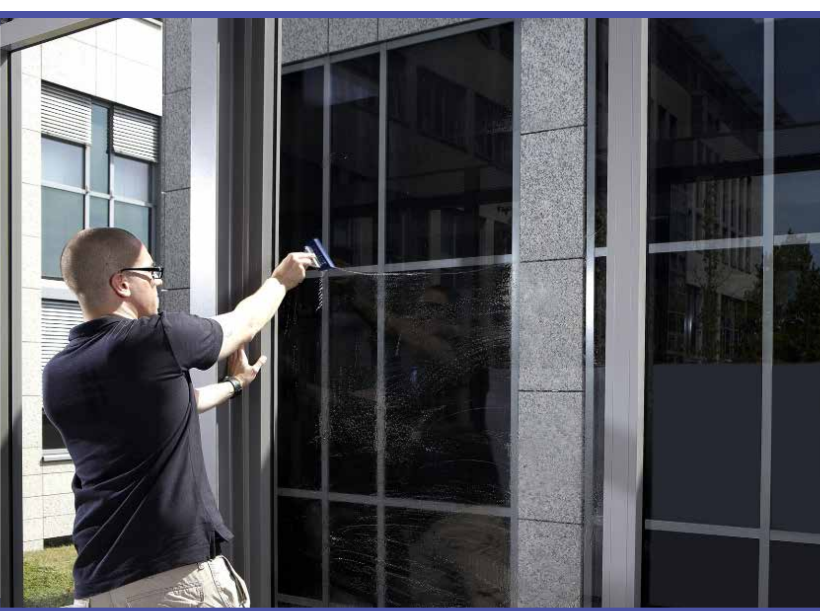
Making a perfect wet application of 3M™ Scotchcal™ Clear View Graphic Film 8150 | Step 4: