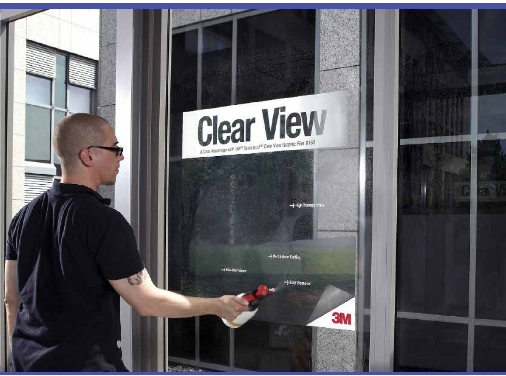
Making a perfect wet application of 3M<sup>™</sup> Scotchcal<sup>™</sup> Clear View Graphic Film 8150 | Step 18: