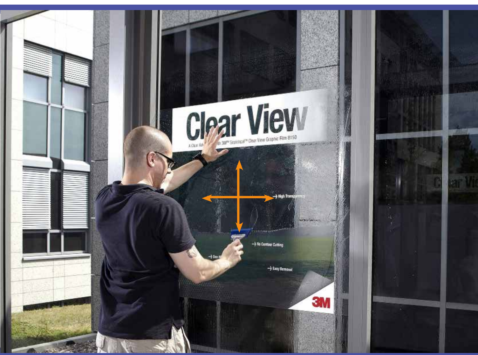
Making a perfect wet application of 3M<sup>™</sup> Scotchcal<sup>™</sup> Clear View Graphic Film 8150 | Step 14: