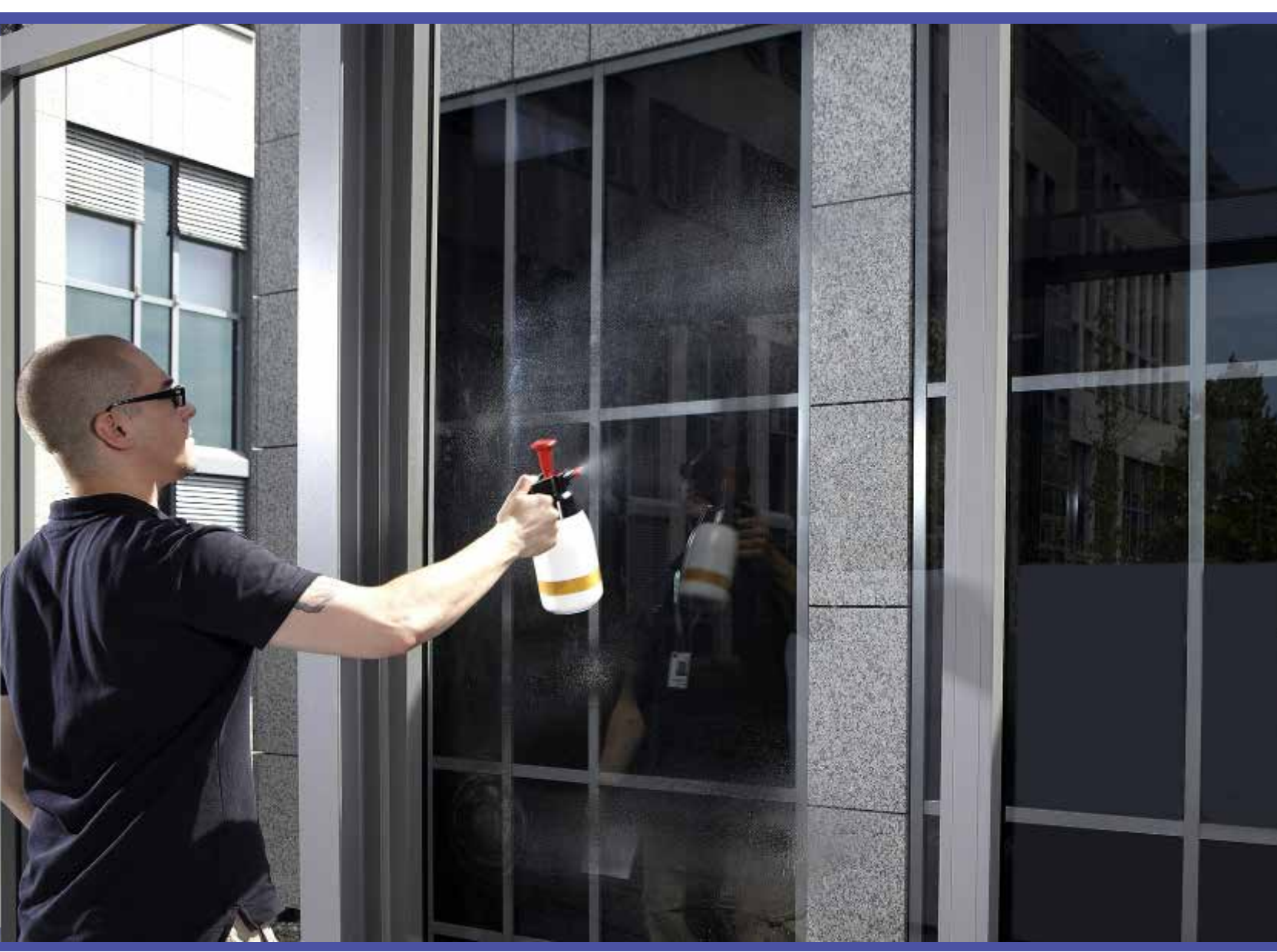
Making a perfect wet application of 3M™ Scotchcal™ Clear View Graphic Film 8150 | Step 1: