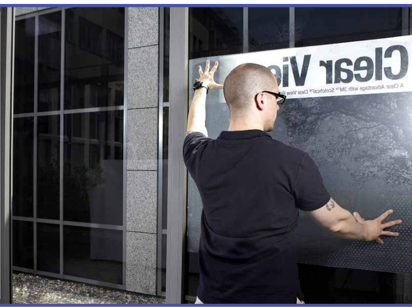
Making a perfect wet application of 3M™ Scotchcal™ Clear View Graphic Film 8150 | Step 6: