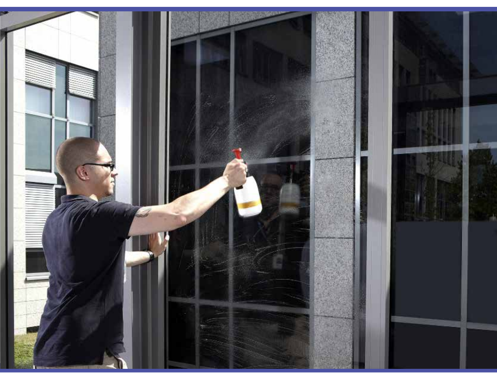
Making a perfect wet application of 3M™ Scotchcal™ Clear View Graphic Film 8150 | Step 3: