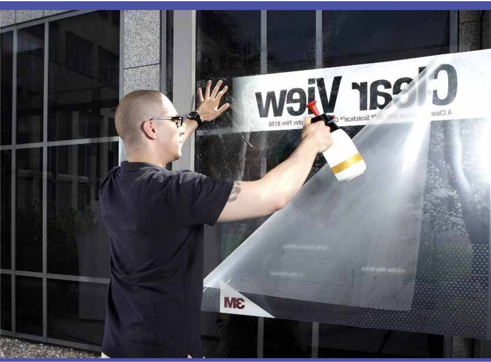
Making a perfect wet application of 3M™ Scotchcal™ Clear View Graphic Film 8150 | Step 8: