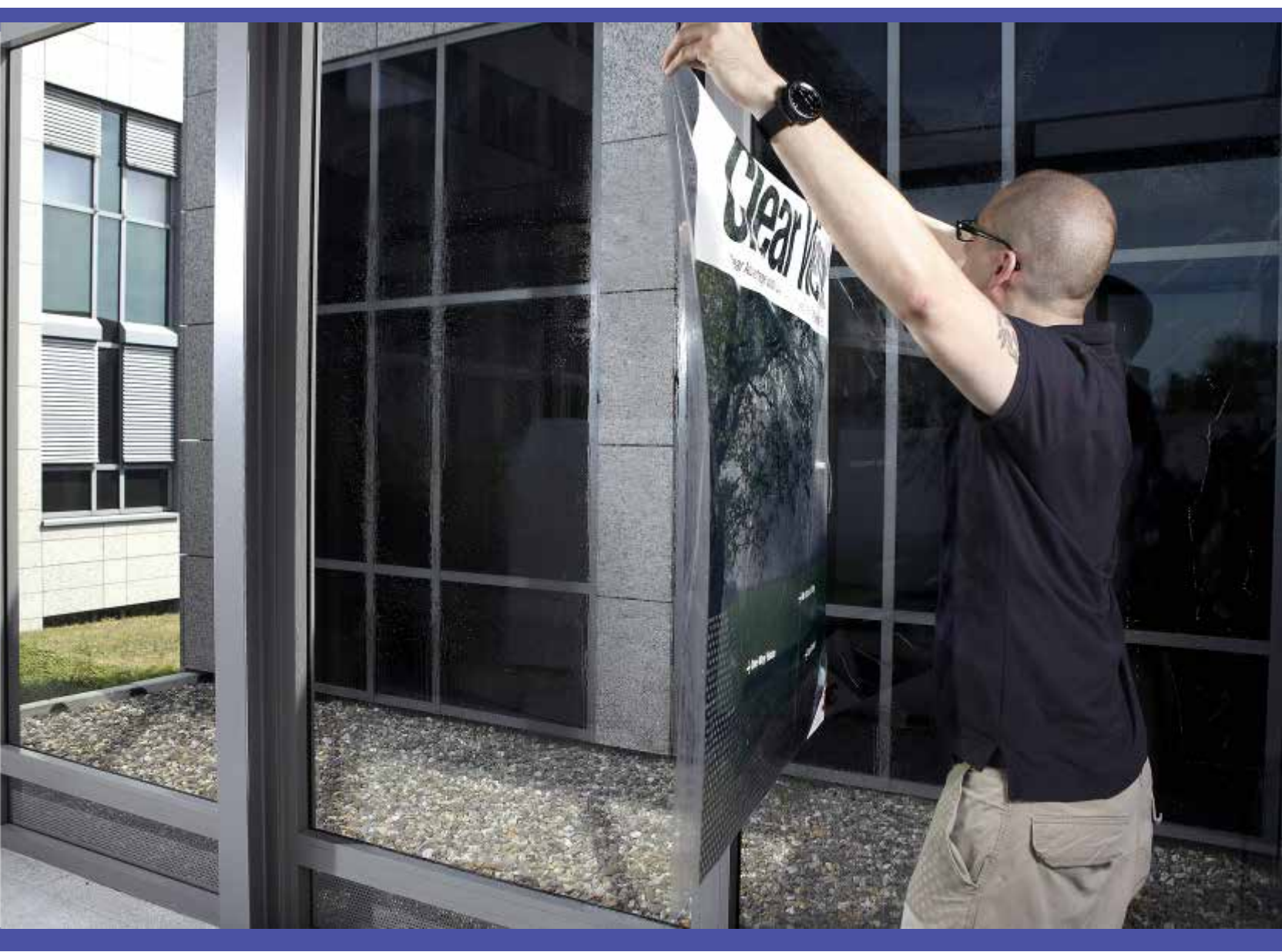
Making a perfect wet application of 3M™ Scotchcal™ Clear View Graphic Film 8150 | Step 11: