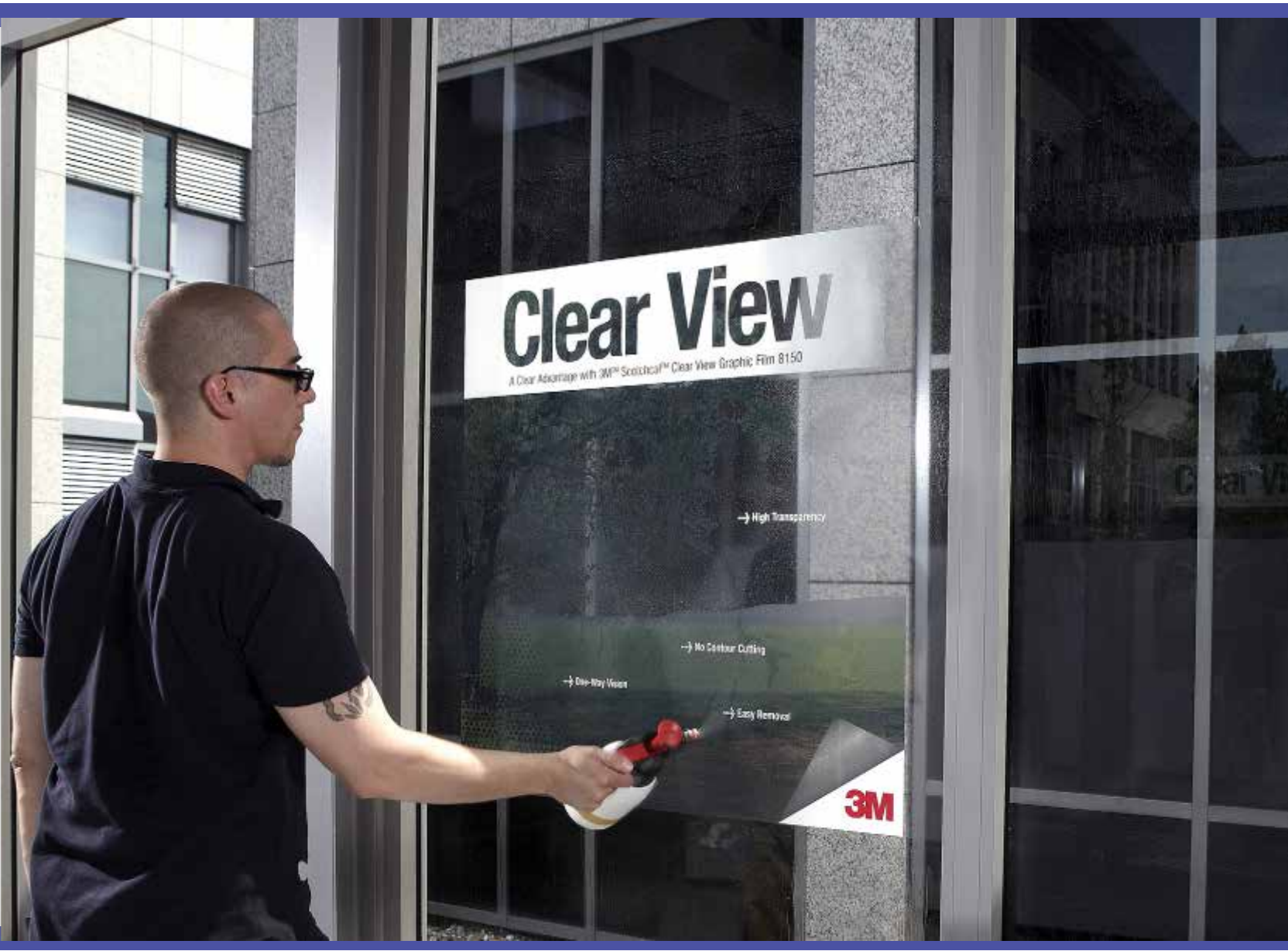
Making a perfect wet application of 3M<sup>™</sup> Scotchcal<sup>™</sup> Clear View Graphic Film 8150 | Step 13: