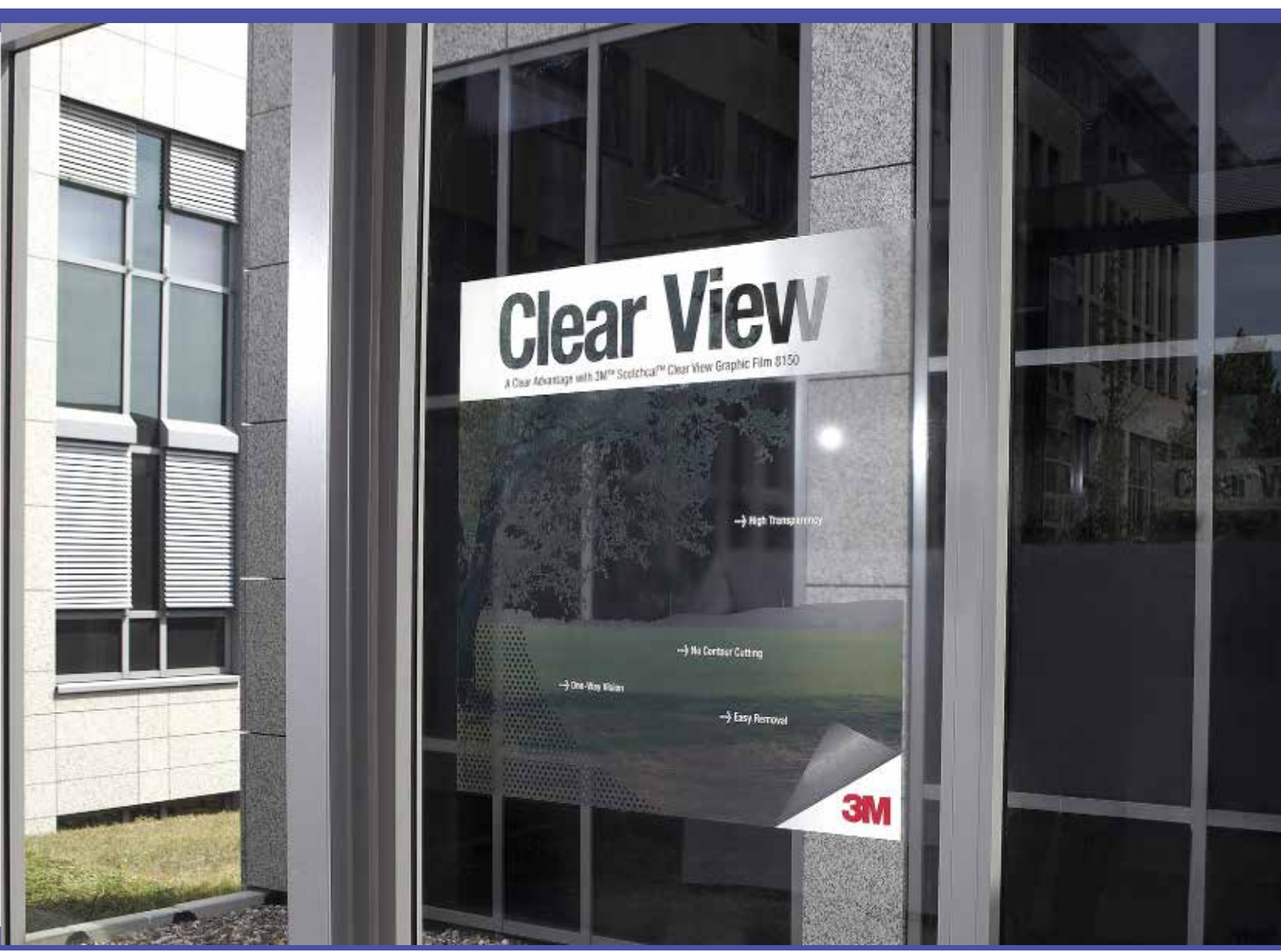
Making a perfect wet application of 3M<sup>™</sup> Scotchcal<sup>™</sup> Clear View Graphic Film 8150 | Step 20: