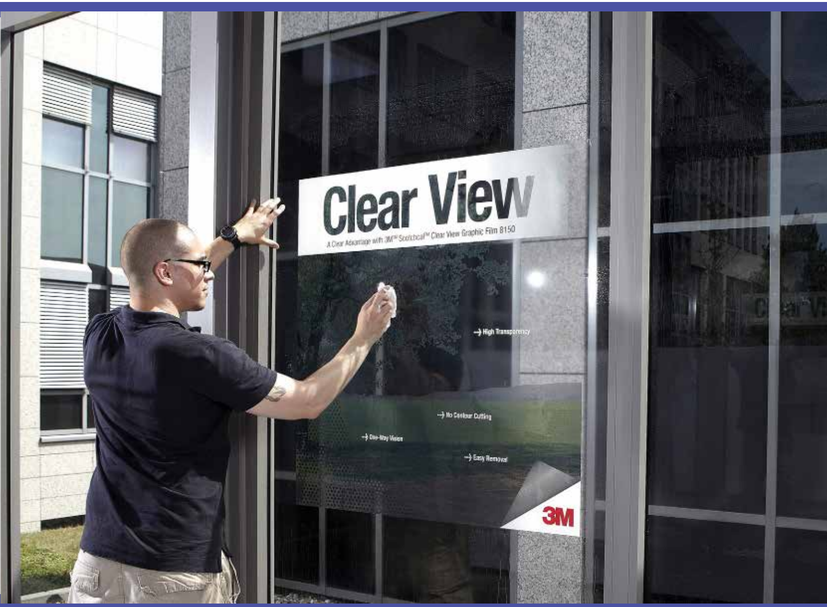
Making a perfect wet application of 3M<sup>™</sup> Scotchcal<sup>™</sup> Clear View Graphic Film 8150 | Step 19: