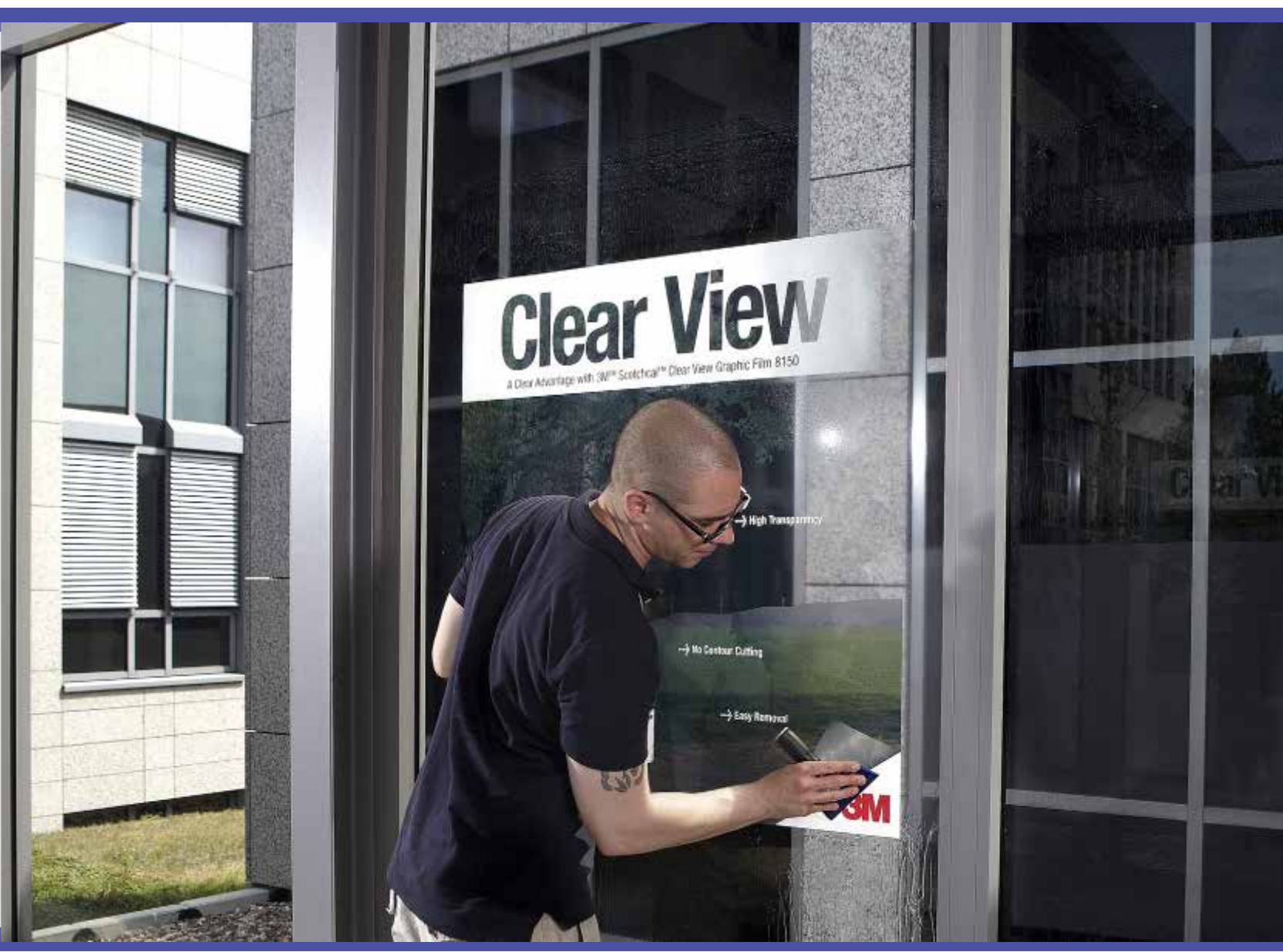
Making a perfect wet application of 3M<sup>™</sup> Scotchcal<sup>™</sup> Clear View Graphic Film 8150 | Step 17: