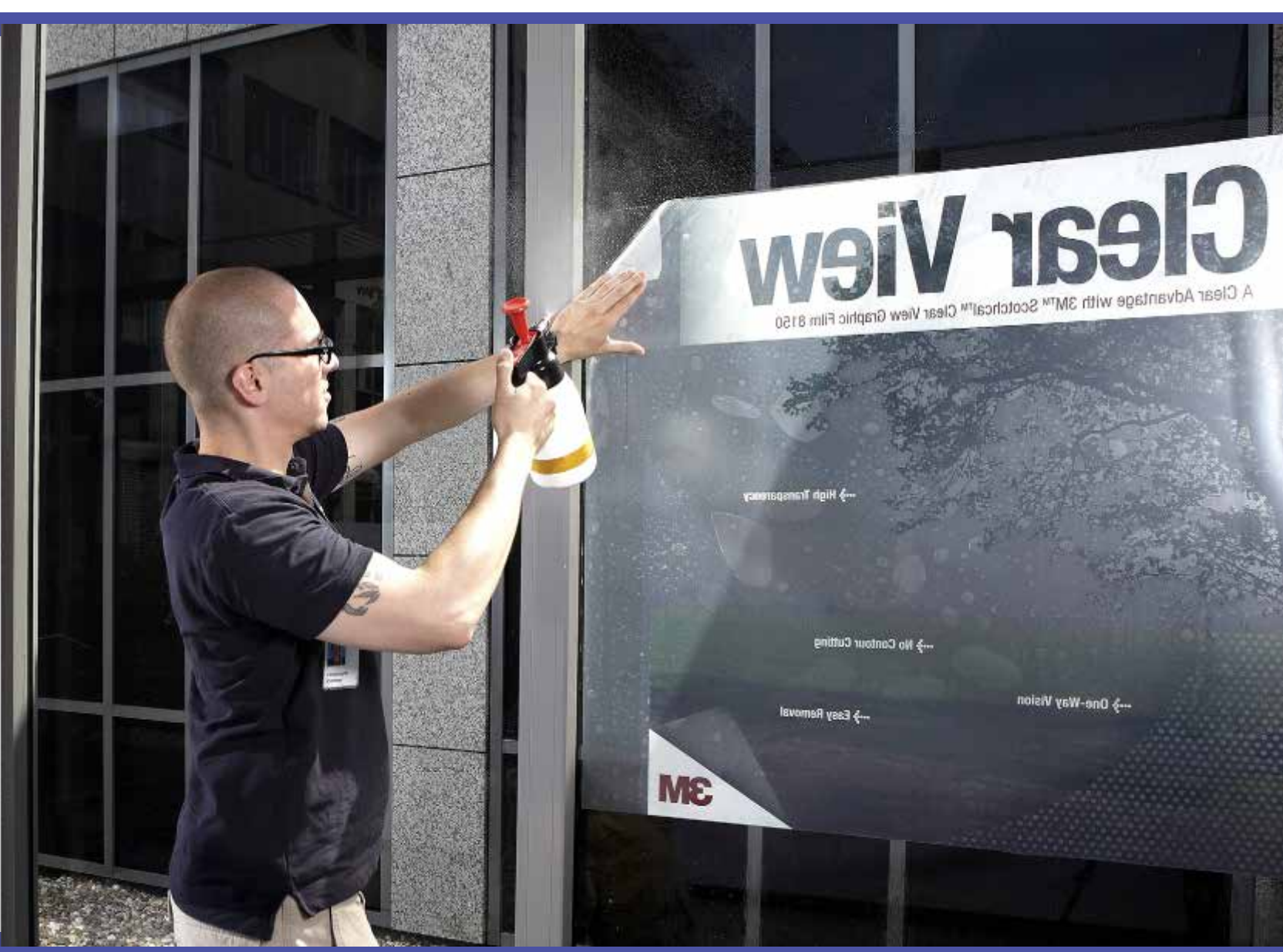
Making a perfect wet application of 3M™ Scotchcal™ Clear View Graphic Film 8150 | Step 7: