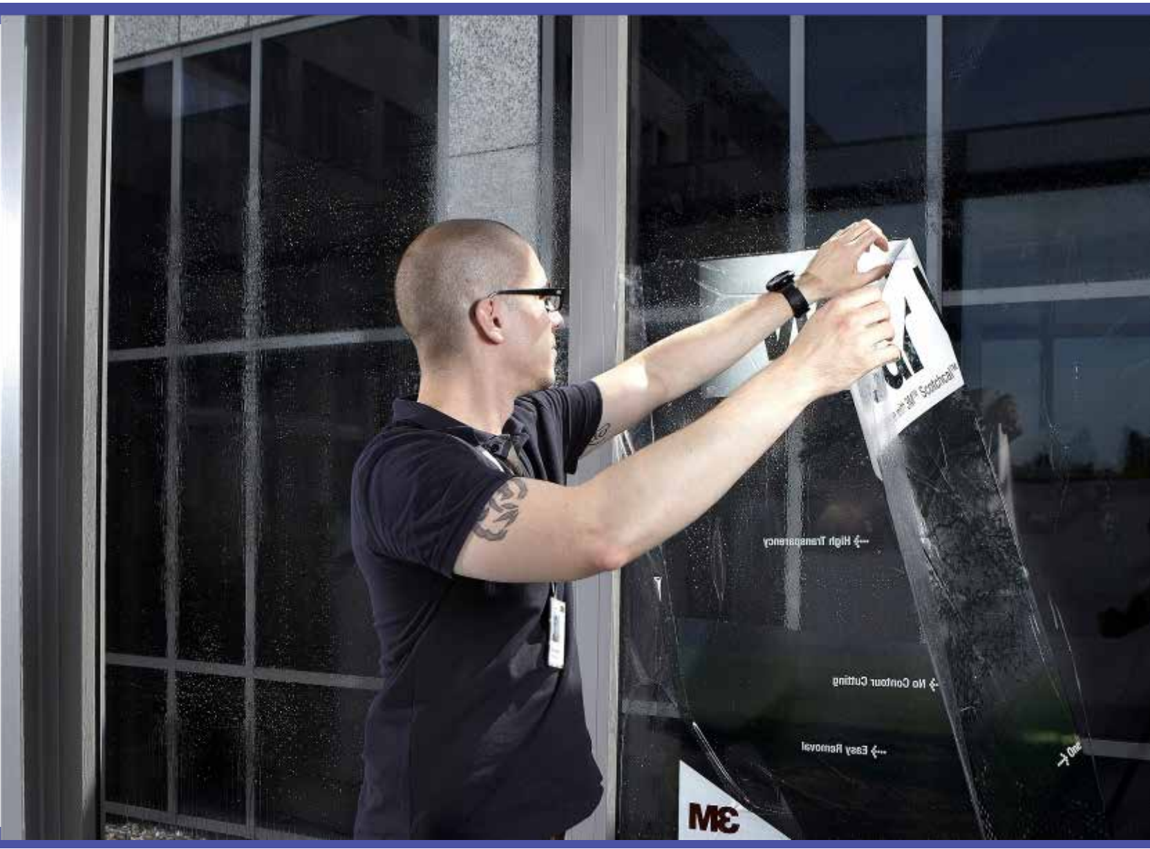
Making a perfect wet application of 3M<sup>™</sup> Scotchcal<sup>™</sup> Clear View Graphic Film 8150 | Step 10: