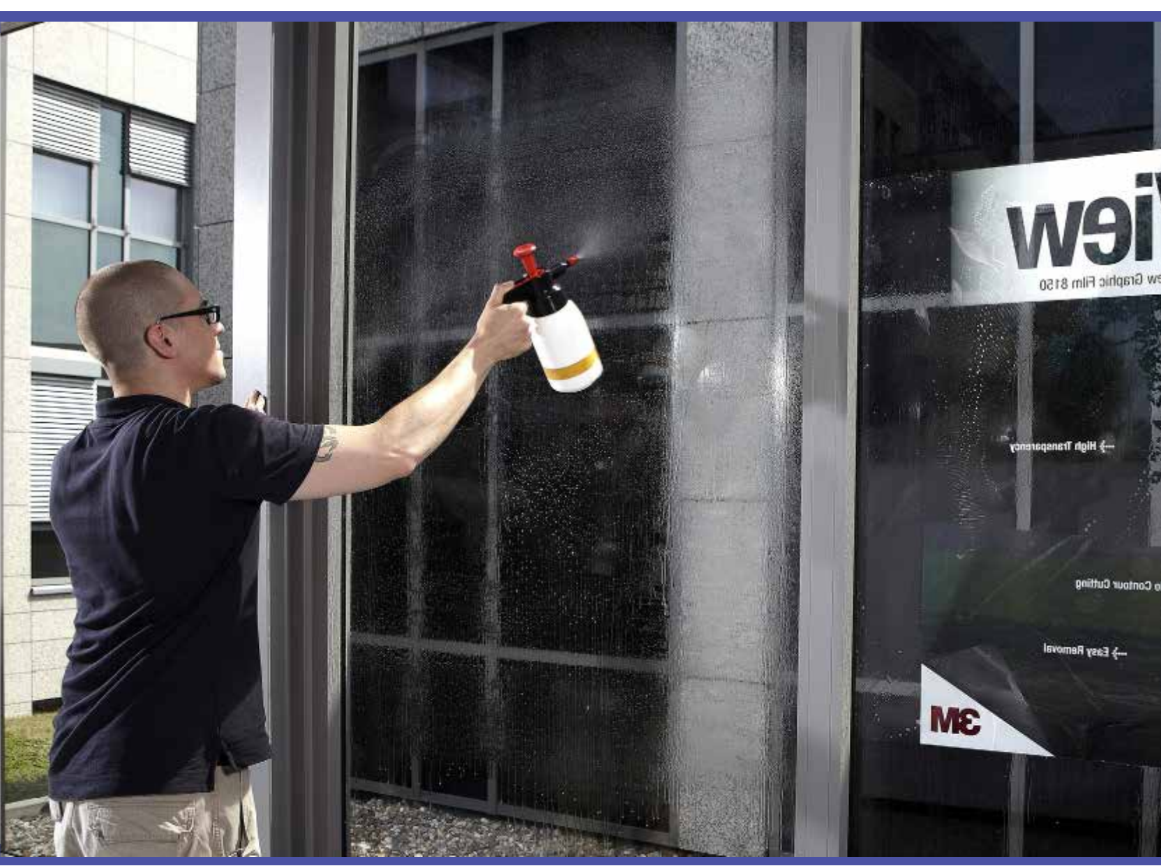
Making a perfect wet application of 3M™ Scotchcal™ Clear View Graphic Film 8150 | Step 9: