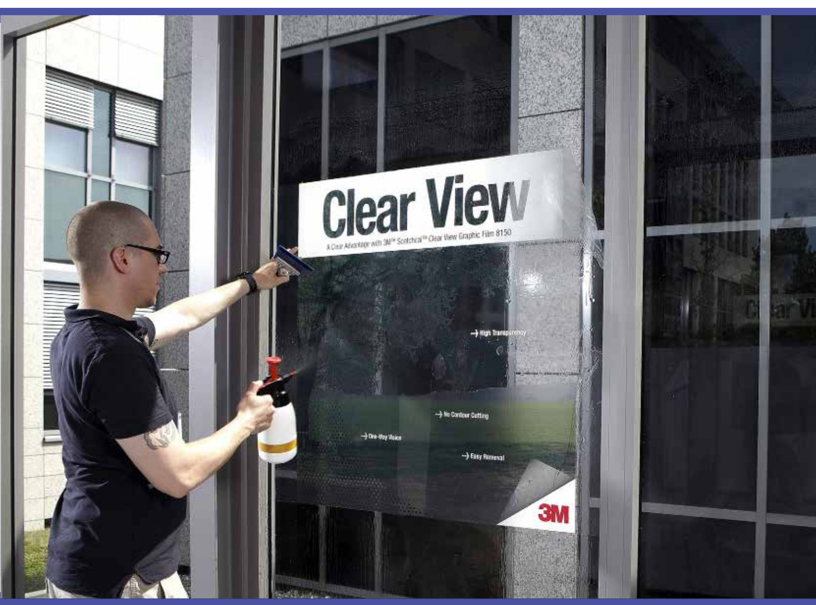
Making a perfect wet application of 3M<sup>™</sup> Scotchcal<sup>™</sup> Clear View Graphic Film 8150 | Step 15: