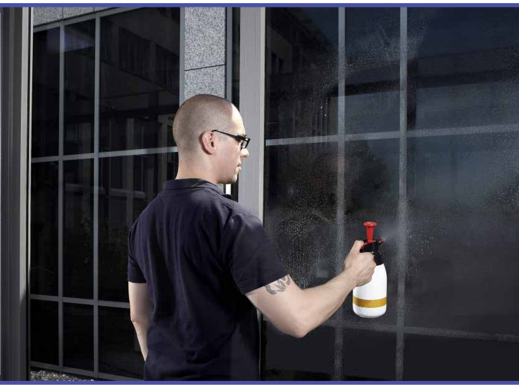
Making a perfect wet application of 3M™ Scotchcal™ Clear View Graphic Film 8150 | Step 5: